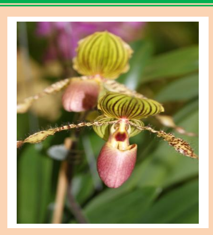
Registrar's Choice – Best Hybrid Paph. Vanguard R Rasmussen 81

City Family$18.00Pensioner Family$9.00City Single$14.00Pensioner Single/Junior$7.00Details for paying membership fees.BSB:- 064823Account Number:- 0009 0973Name of Account:- Townsville Orchid Society Inc.Commonwealth Bank, AitkenvaleFees are due 1<sup>st</sup> September each year