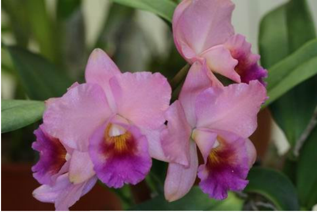
Sc. Dal's Beau