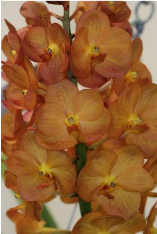
Ascda. Udomchai 'The King'