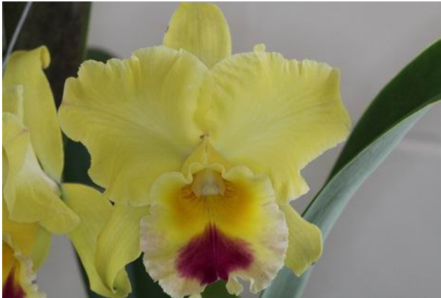
Blc. Goldenzelle 'Lemon Chiffon'