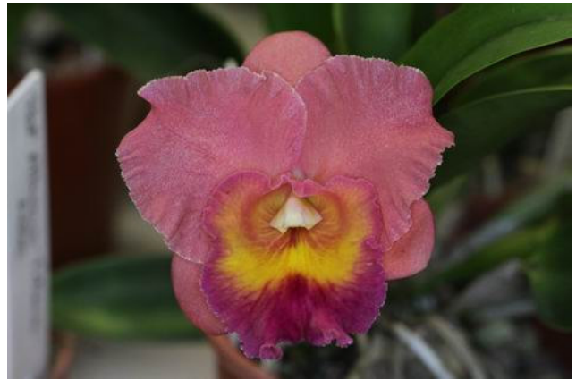
Sc. Dal's Beau 'Ines'