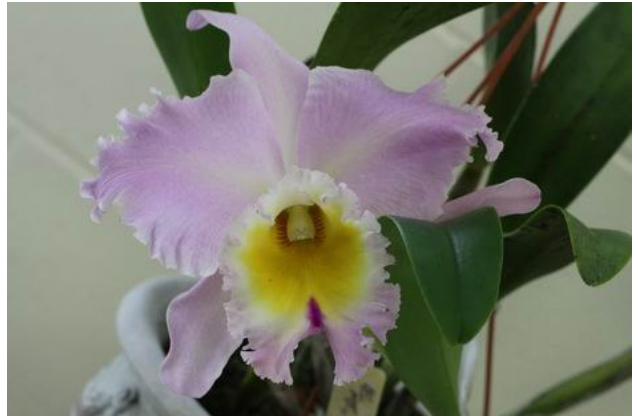
Blc. Mount Anderson