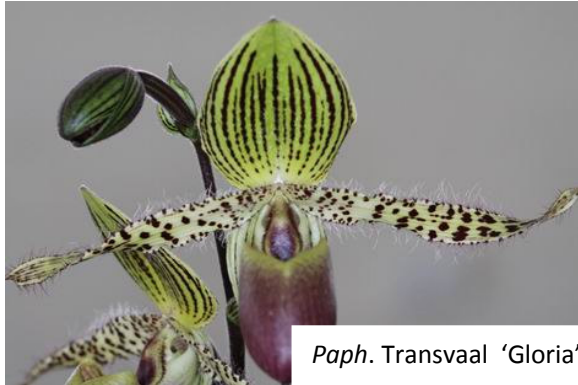
Paph. Transvaal 'Gloria'