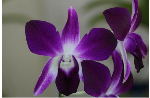
Den. Bom Juri 'Red'