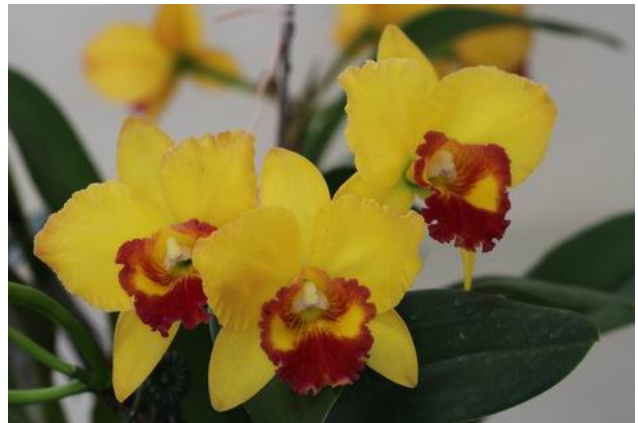
Blc. Love Call 'Rouge'