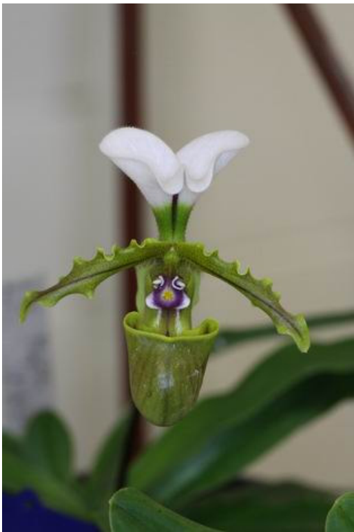
Paph. spicerianum giganteum