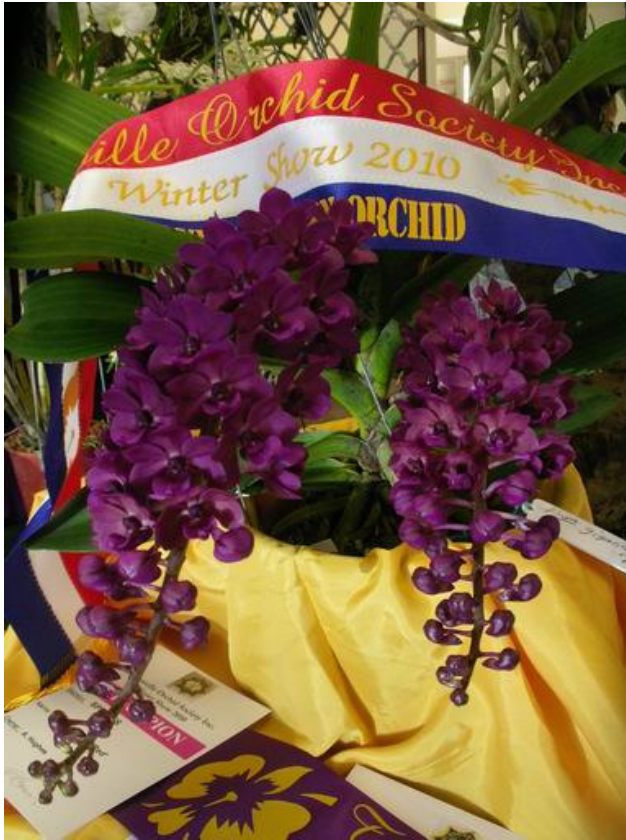
Rhynchostylis gigantea 'Red' Allan Hughes