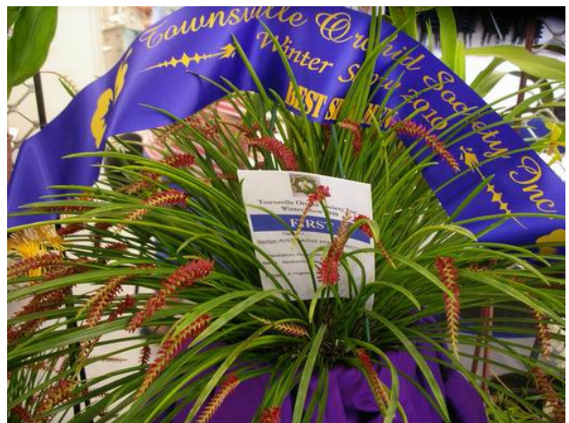
Dendrochilum wenzelii Allan Hughes