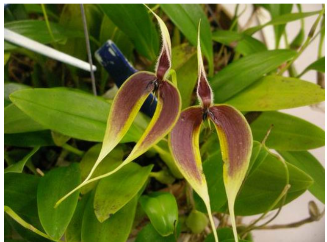
Bulbophyllum masdevalliaceum Allan Hughes