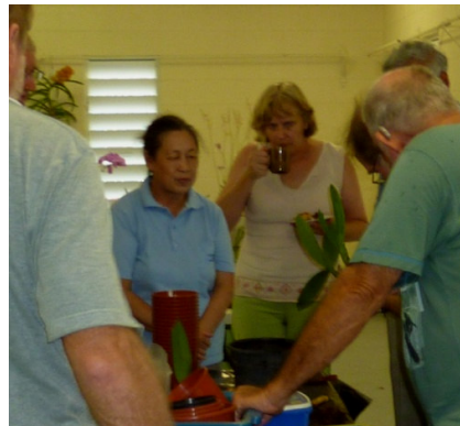
THIS ONE TAKEN 28.02.10