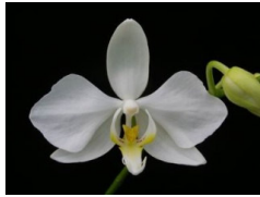
Phalaneopsis amabilis var. rosenstromii