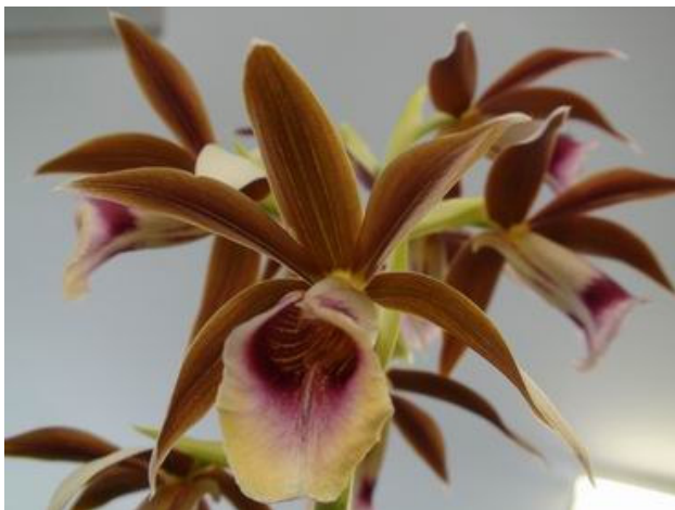
Champion Australian Native: Phaius tankervillae (J A Nuss)