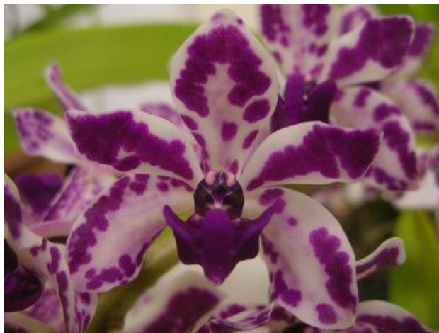
Species: Rhy. gigantea was given 79 Points and owned by W&C Sewell