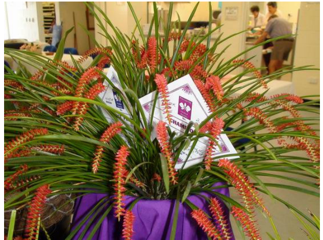
Champion Species: Dendrochilum wenzelii 'Rod' (A Hughes)